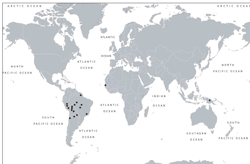
Geographic distribution of specific sociative causative markers

By contrast, we found very few examples of specific sociative causative markers in other parts of the world, even in Meso- and North America. As a matter of fact, we only found these types of markers in Wolof (Atlantic family, Senegal) and Alambak (East Sepik, Papua). This particular distribution of specific