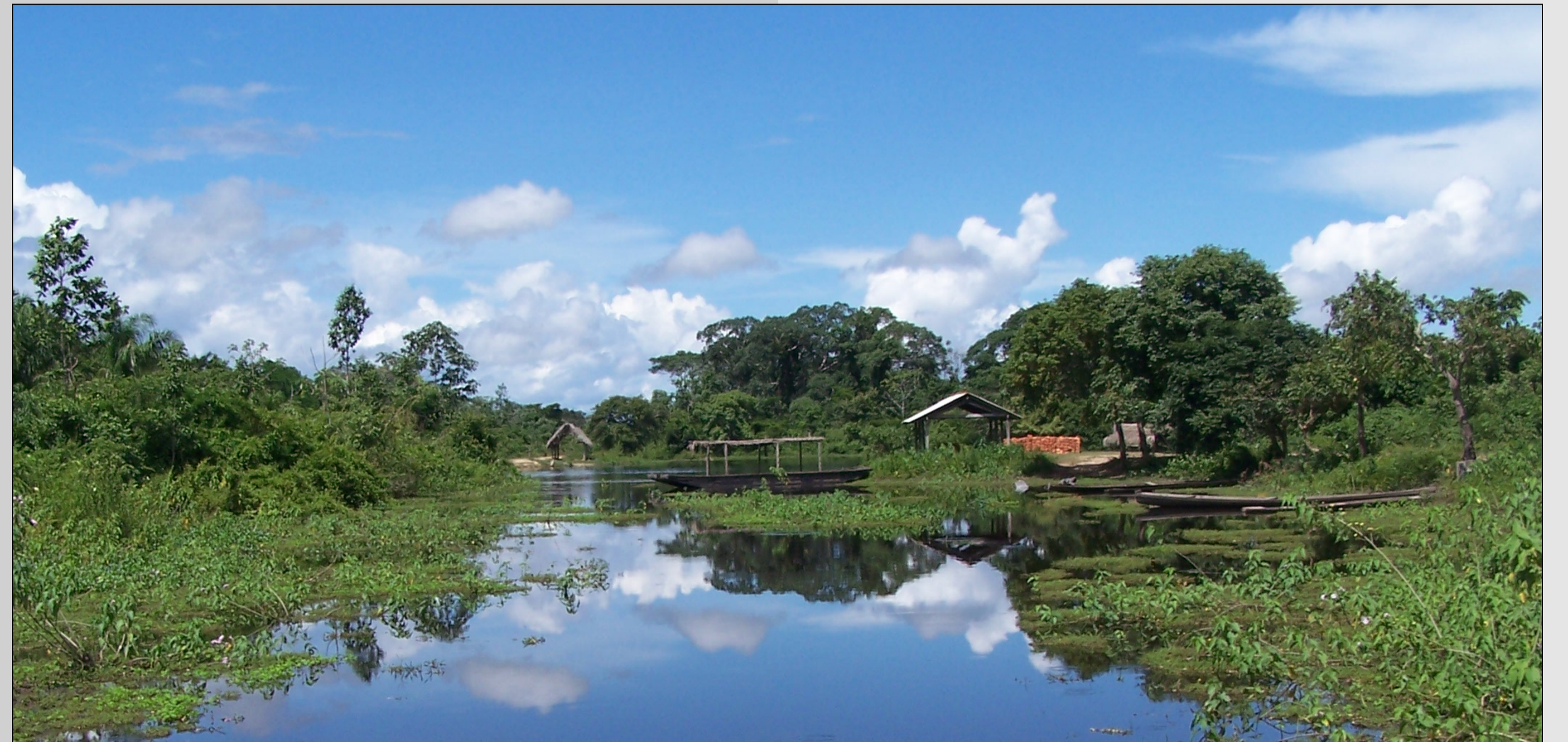
Baures is situated at the Río Negro, navigable only in the rainy season (for exchange with Brazil)

However, in recent years, a growing attention for indigenous cultures can be noticed in Bolivia. For Baure, there have been several attempts to develop a revitalization program and the Baure documentation team supports local initiatives of revitalization with all possible means.