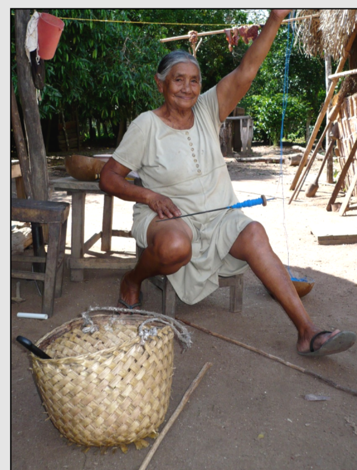
Baure speakers and their daily activities a. in a canoe, b. weaving a hammock, c. knitting a fishing net, d. making thread

However, in recent years, a growing attention for indigenous cultures can be noticed in Bolivia. For Baure, there have been several attempts to develop a revitalization program and the Baure documentation team supports local initiatives of revitalization with all possible means.