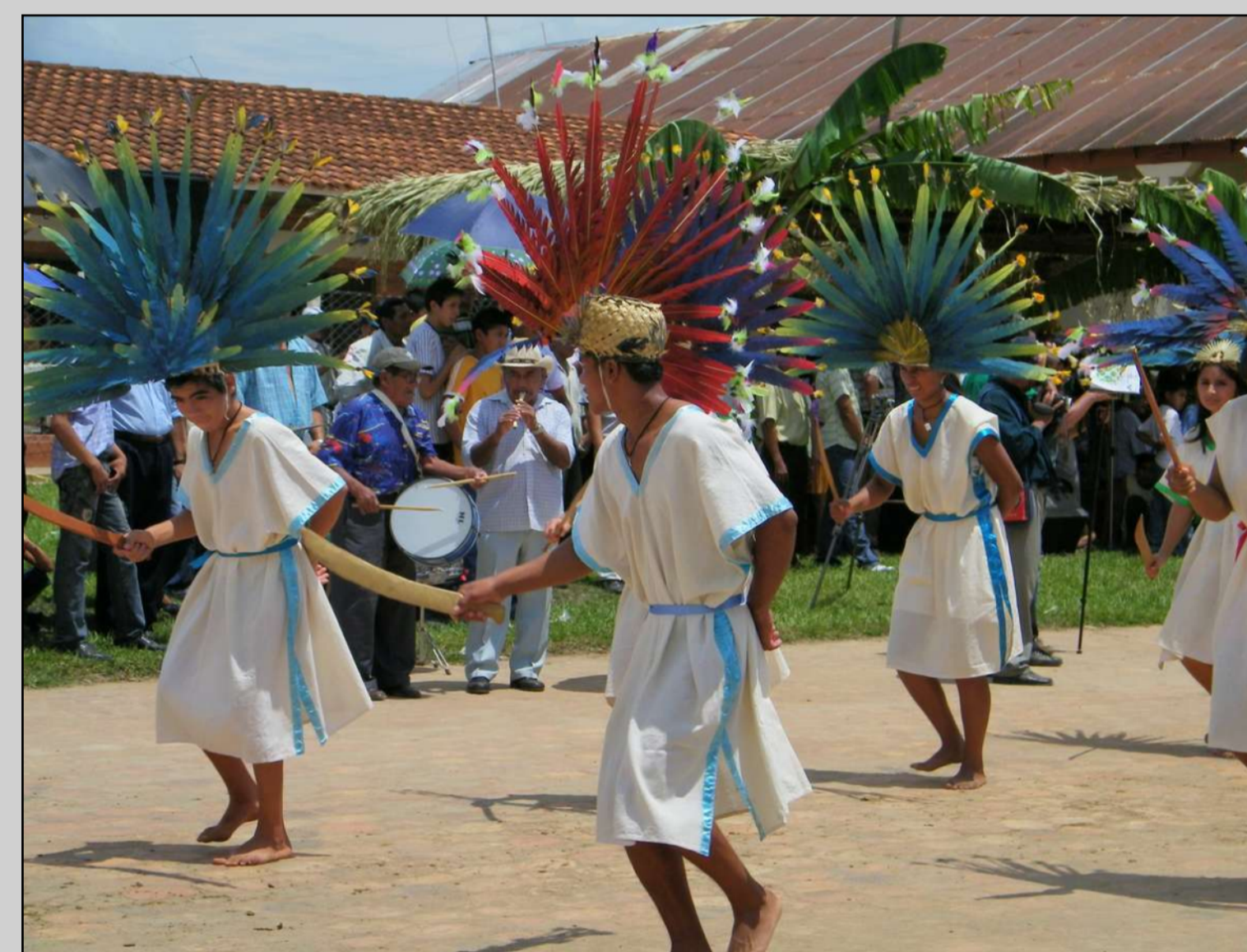
The Machetero dance at the annual festival