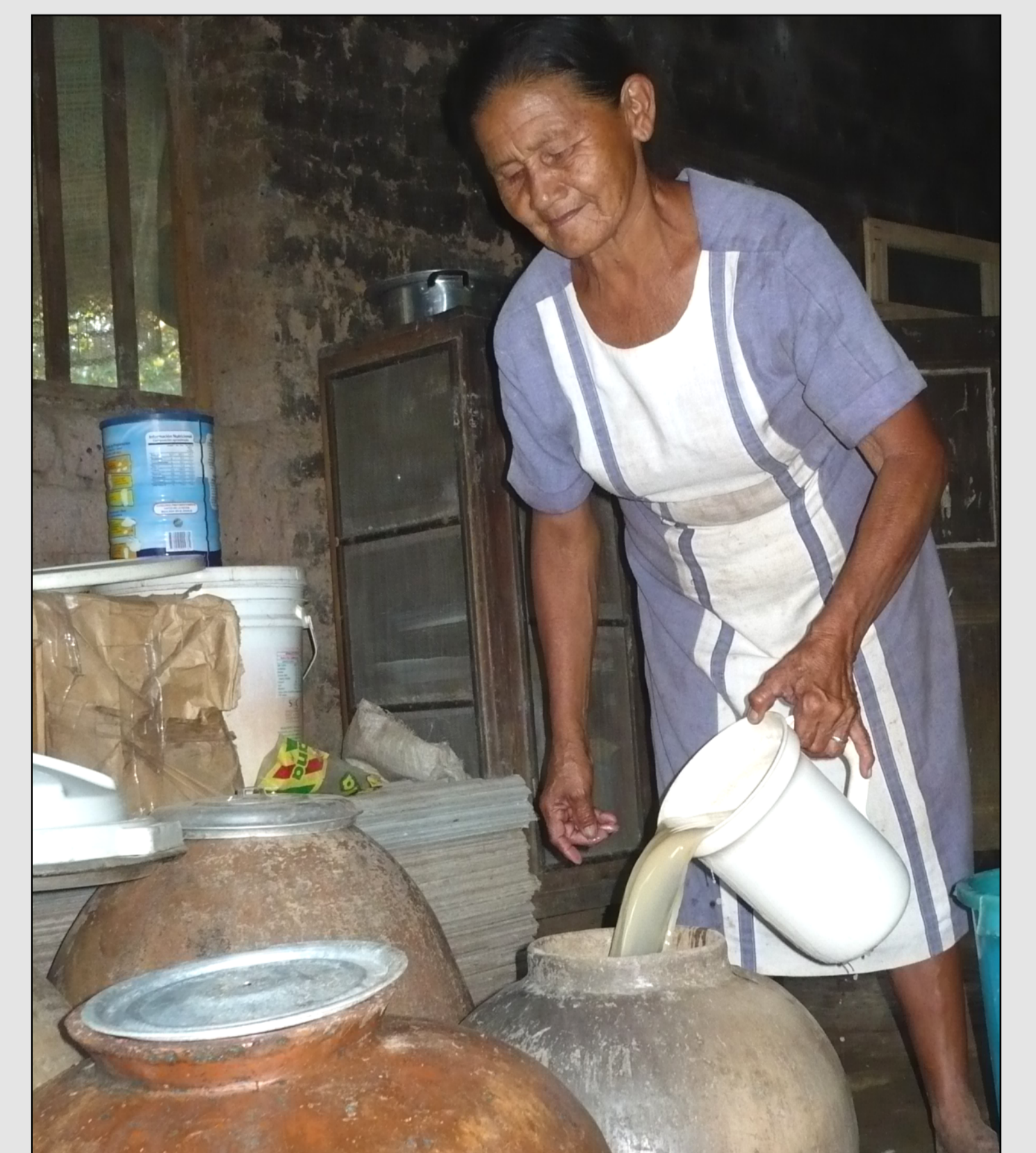
Chicha (fermented maize drink) is made for special occasions and an important cultural element in Baures